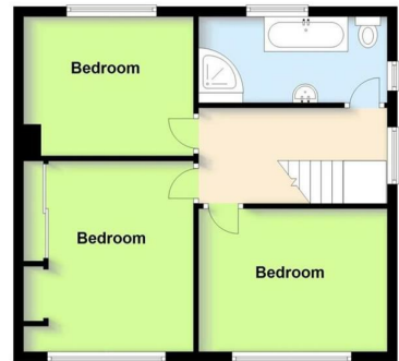
First Floor Approx. 48.9 sq. metres (526.9 sq. feet)

Total area: approx. 117.9 sq. metres (1268.8 sq. feet)