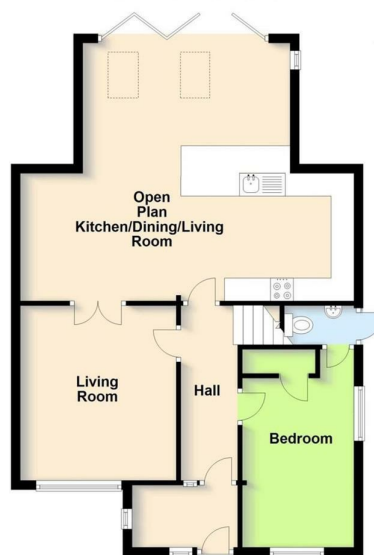
Ground Floor Approx. 68.9 sq. metres (741.9 sq. feet)

Total area: approx. 117.9 sq. metres (1268.8 sq. feet)